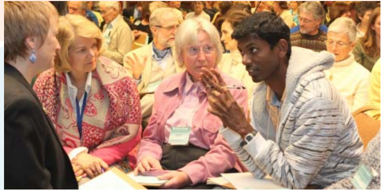
Meet people from around the world who share how truth reveals itself to them.