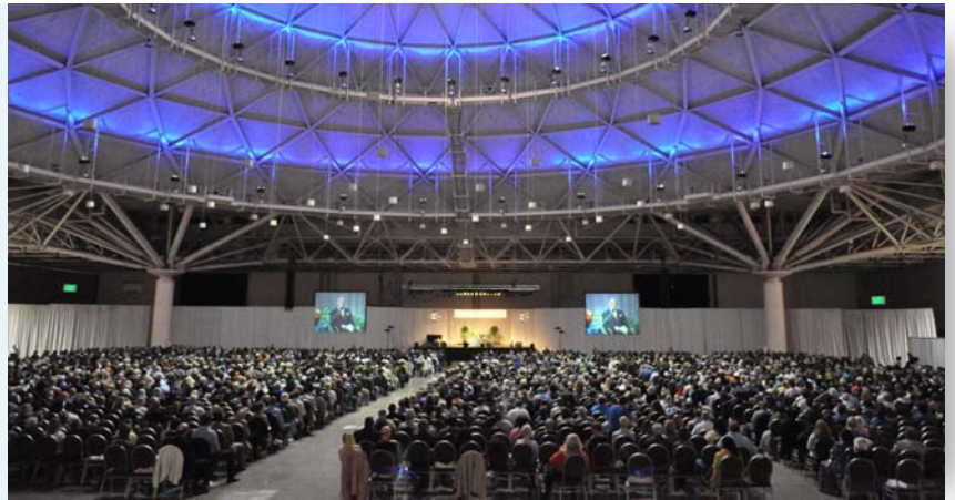
Meet other people from all over the world who have experienced the Light and Sound of God.