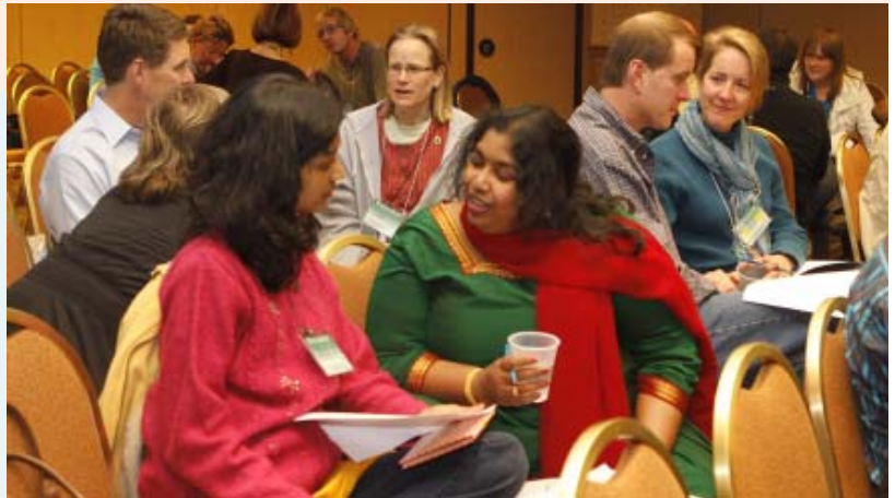
Meet people from around the world who share how truth reveals itself to them.